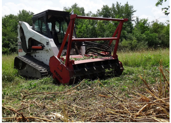
Figure 4. A forestry cutter is a specialized mower capable of clearing brush and woody stems several inches in diameter. Forestry cutters are useful for clearing woody vegetation that is becoming too dense. They also serve as good first step in eliminating exotic shrubs, as the resprouts can be selectively removed with a foliar herbicide application.

as well as campground and tenting areas. This presents a range of opportunities for habitat creation and enhancement.