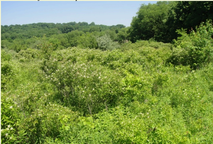
Figure 1. Young forest habitat is a mix of native shrubs, sapling trees, and native herbaceous vegetation near intact forest and residual mature trees. The height and density of the vegetation is varied and patchy. Young forest habitat has been in steady decline due to changes in land use and an increase of invasive species.

water, food, shelter, and space. 'Shelter' describes the space animals use to nest, rest, and hide from their predators, while 'space' describes the area they need to forage for food and seek their mates. What 'food' is depends where you are in the food chain. However, whether you're a caterpillar or an apex predator, the quality of the habitat depends on having the right plants.